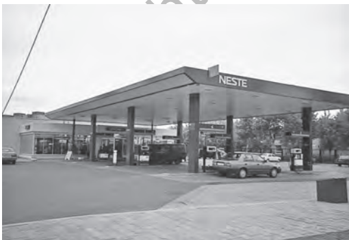
FIGURE 1.16. Neste service station in Narva. Since the breakup of the Soviet Union, car owners in the Estonian border city of Narva have been able to gas up at this modern Neste service station. Like many other Finnish companies, Neste has invested heavily in Estonia, as well as in Poland and Russia.

There is also great economic diversity within the region. The contrast in wealth between northern Italy and the Mezzogiorno, the popular name since the 18th century for the south of Italy, is enormous. There are even some voices in the north that have called for secession from Italy because of the perceived burden on the north of supporting an "indigent" south. Even culturally the Po Basin is far closer to the "European heartland" than the Mezzogiorno, as our inclusion of the Milan and Turin regions in that area indicates. The contrast is not quite so great in Spain, but Andalusia is far less well off than Catalonia. A recent boom in "Sun Belt" high-tech economic development has been instrumental in drawing parts of the region together. The main beneficiaries are the cities that form an arc following the Mediterranean coast from Catalonia through the south of France and down into western Italy as far as Rome. Known variously as the