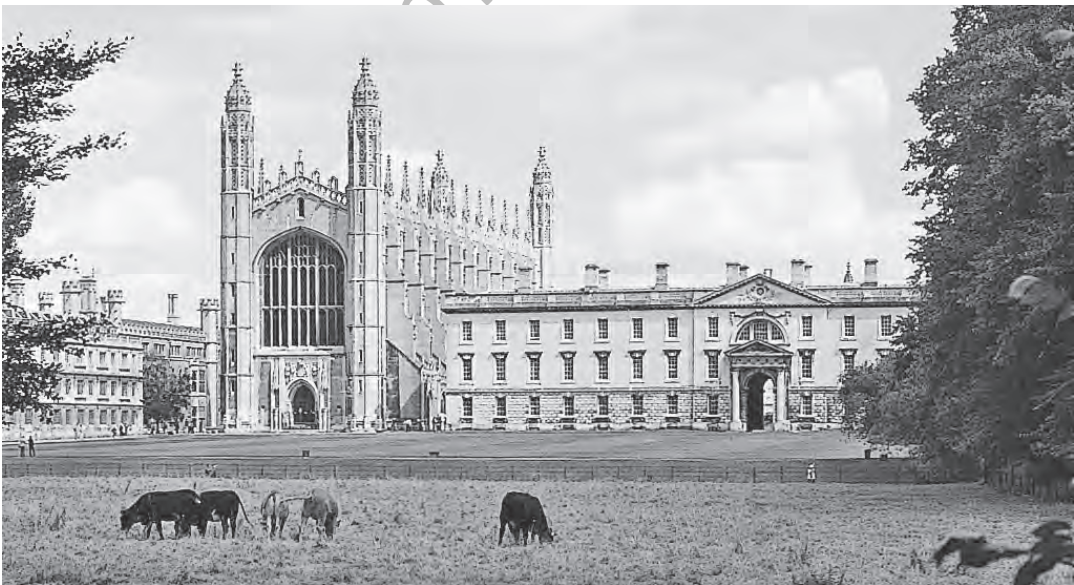
FIGURE 1.9. Cambridge University. One of the great seats of learning and a hotbed of Protestant thought at the time of the Reformation, Cambridge University was founded in the midst of a great wave of university establishments that spread across Europe from Italy between the 12th and 16th centuries. King's College and its famous Gothic chapel are viewed here across the "Backs," the name given to the lush meadows that line the River Cam.

Not until the very end of the 15th century did Christian civilization, pent up for a thousand years in this small western peninsula of the Eurasian continent, finally break