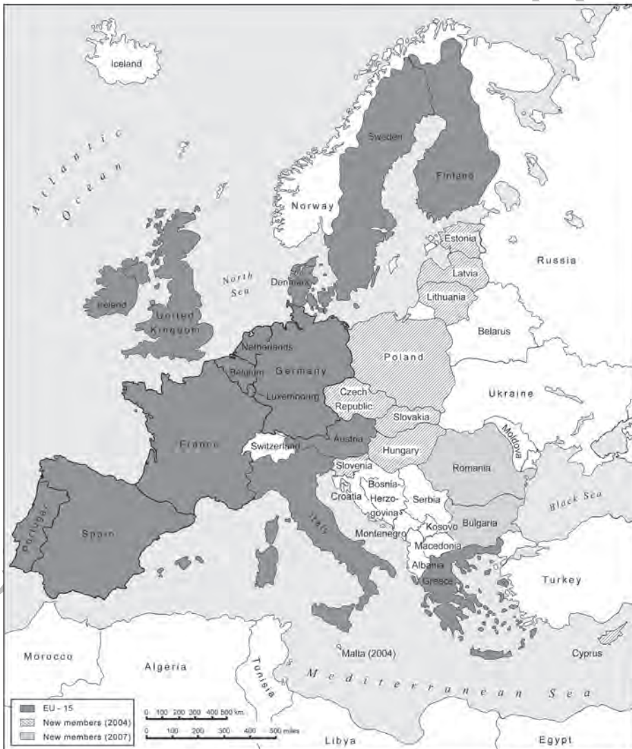
FIGURE 1.4. Europe and the European Union.

Nonetheless, the realization of a completely unified Europe still lies in the future. The region continues to be a composite of smaller instituted regions—the nation-states—that in many cases cling tenuously to their individual identities, powers, and prerogatives. For our purposes, then, we prefer to define Europe for now as a uniform denoted region, a realm whose people share a cultural tradition that sets them apart from peoples elsewhere in the world and gives