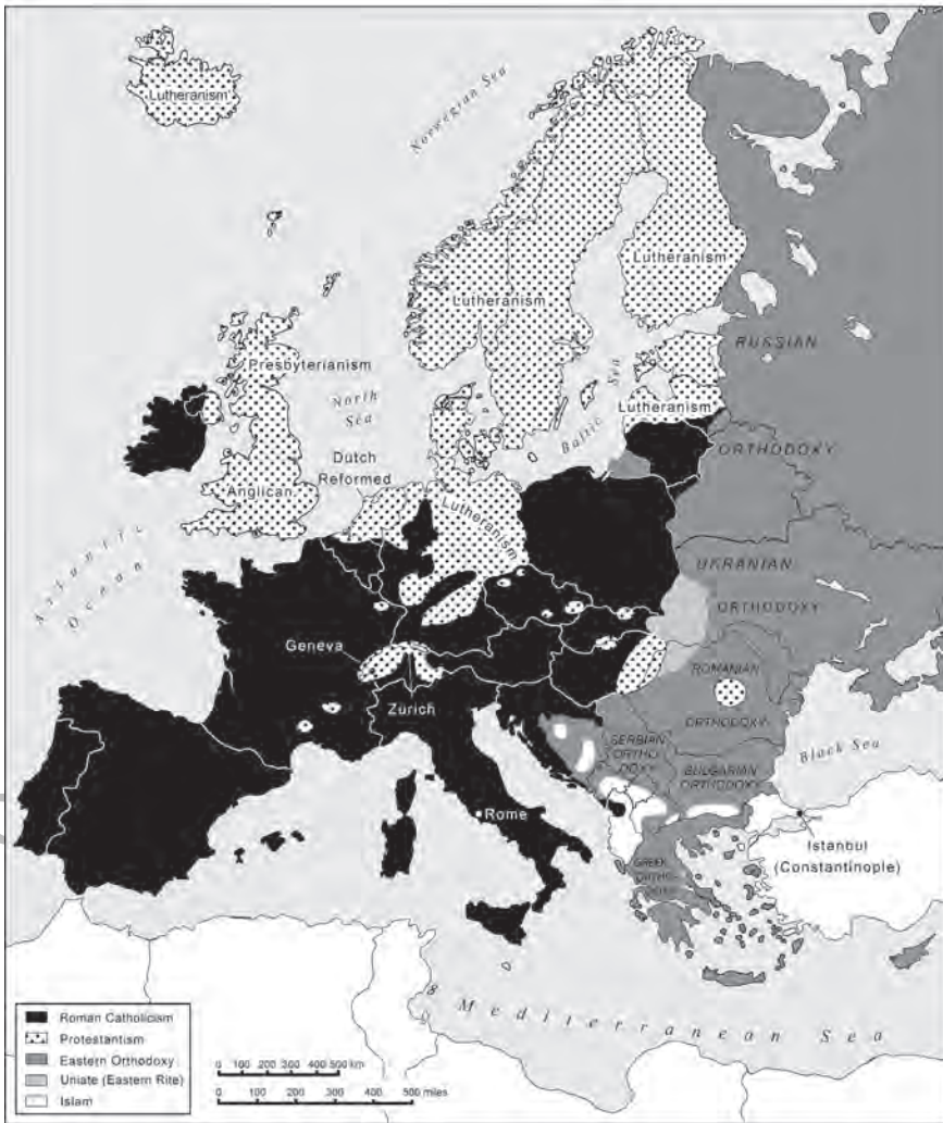
FIGURE 1.6. Religions in Europe.

Like most philosophical religions, Christianity has been susceptible to theologi-