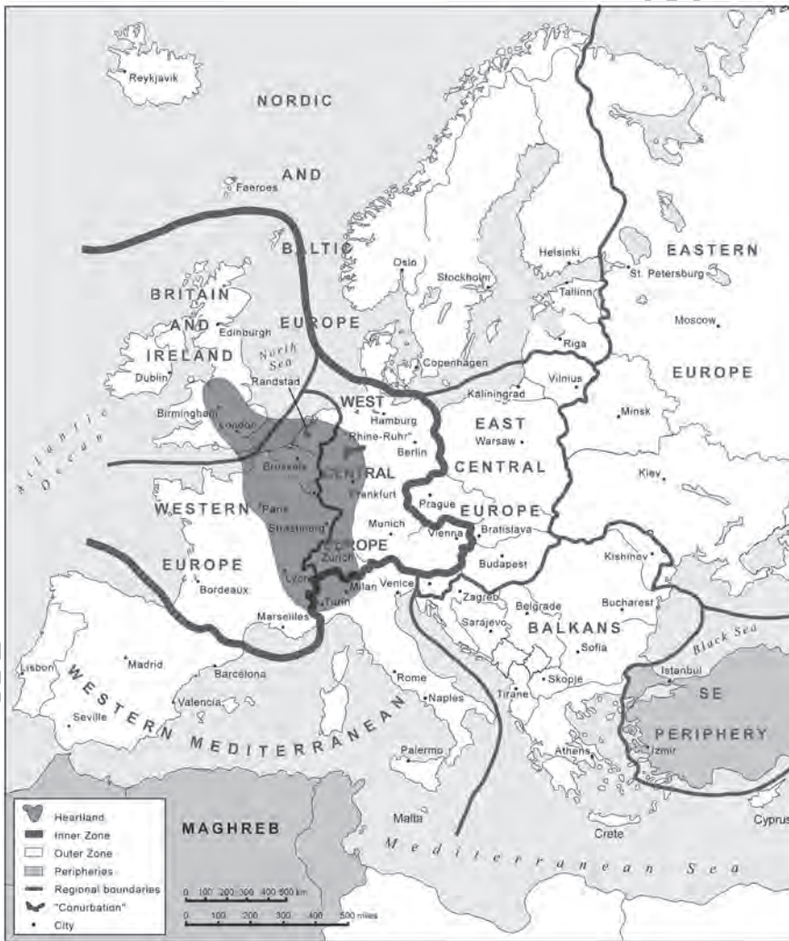
FIGURE 1.11. A regionalization of European culture.

In a sense, since the end of the Middle Ages western Europe can be considered the “head-quarters” or “cornerstone” of Europe. From a historical perspective, this is largely because of France, which was one of the most