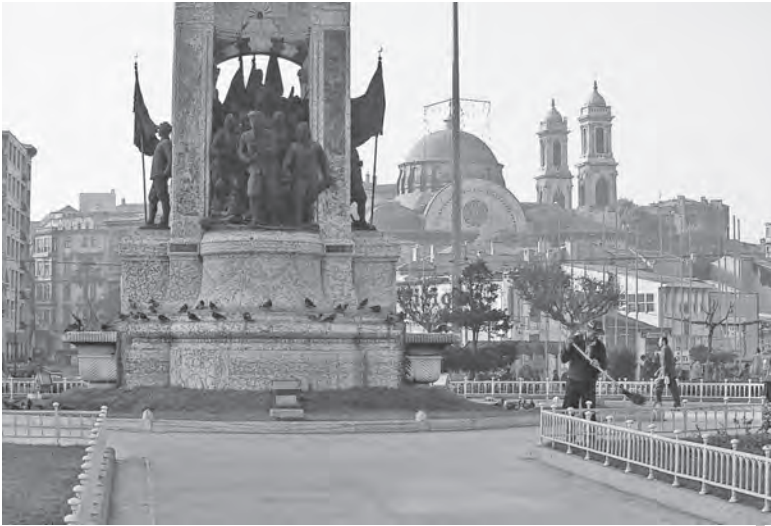
FIGURE 1.19. Monument of the Republic. Erected in 1928 in the center of Istanbul's sprawling Taksim Square, this monument commemorates the birth of Mustafa Kemal Atatürk's modern Turkish Republic. The soldiers with flags, who stand on either side of the monument, symbolize Atatürk's motto of "Peace at home, peace abroad." One is an unknown soldier who guards the Turkish nation, the other a soldier of peace.

ment and reject the kind of fundamentalism evident in some Arab countries and in Iran.