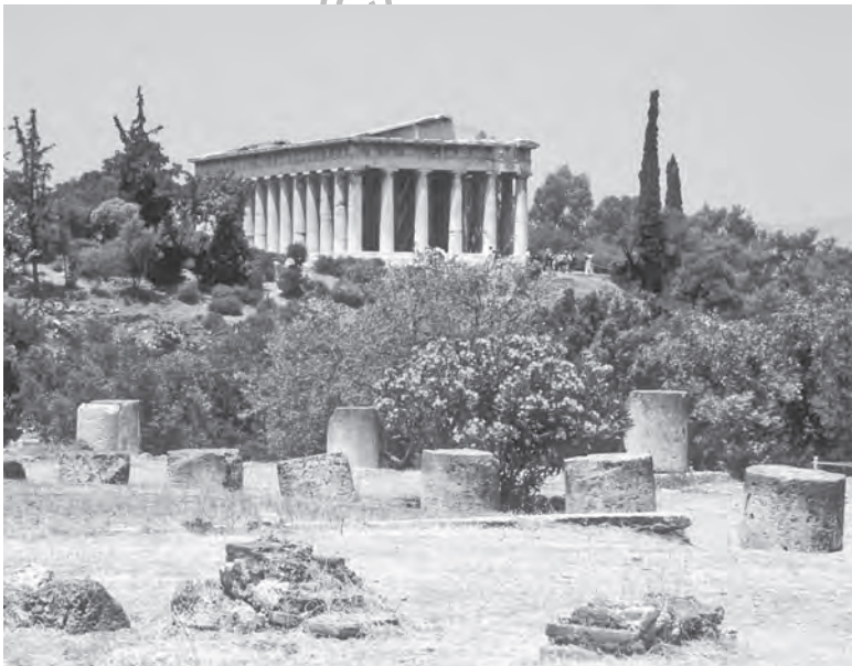
FIGURE 1.5. The Athenian agora. The agora was at the heart of ancient Athens—the place where citizens participated in the cultural, political, commercial, and administrative life of the polis . The agora was also a religious center. The building at the top center of the photo is the Temple of Hephaestus, dedicated to the two gods Hephaestus and Athena during the fifth century BCE.

It was a converted Greek Jew, the apostle Paul, who interpreted Christ's teachings to the Gentiles (as the Jews called them) and laid the foundation for Christian dogma. Greek thought, and Neoplatonic philosophy, in particular, imparted a structure to Christian doctrine that had no biblical foundation. Nonetheless Christianity has contributed much to European culture that is not Greek in origin. Most important, perhaps, is the Judeo-Christian code of ethics, which elaborates what is acceptable and what is unacceptable behavior in European societies. This ethical system is founded on the notion that there is a moral code of law handed down by God. Out of this law came the seven virtues and the seven deadly sins. Jewish tradition emphasized the necessity to follow this code to the letter; Christ emphasized rather the spirit of the law, especially love of God and one's neighbor. This ethic is radically different from that of the Greeks and Romans, who had no conception of a divinely dictated moral code. For them, everything that one did was a matter of practical reasoning. One could do well or poorly. In the Judeo-Christian view doing badly in school or at sports is entirely different from failing to help someone in need. The former is a fault,