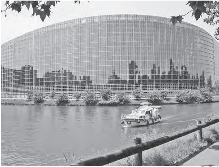
FIGURE 1.2. The European Parliament in Strasbourg. In sharp contrast to the highly decorated Gothic west front of Strasbourg's medieval cathedral is the modern headquarters of the European Parliament, opened in 1999.

treatment of these people and their region is organized topically and is both contemporary and historical in its approach. And, as our brief opening comments about the city of Strasbourg and its inhabitants suggest, we focus on the multiplicity of influences and conditions that underlie the way in which Europeans live their daily lives and see their place in Europe and the world.