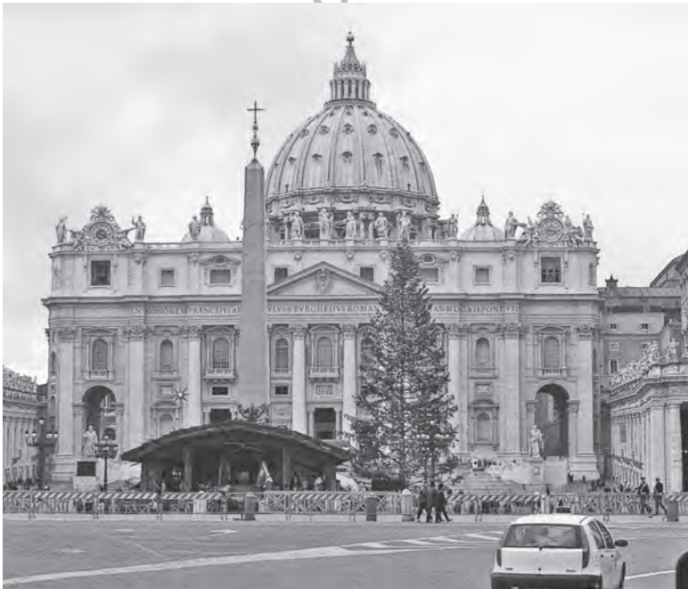
FIGURE 1.7. St. Peter’s Basilica. St. Peter’s is the hub and principal shrine of the Catholic Church, which has attracted the largest number of Christians in Europe. The present structure, which is the largest in all Christendom and is said to stand on the final resting place of St. Peter, was built during the 16th and 17th centuries. The obelisk that marks the center of the immense piazza in front of the Basilica was brought there from the Roman circus where Peter was martyred.

The second major schism occurred within the Western Church in the 16th century and led to the establishment of a variety of “national” Protestant Churches. A defining element of the Protestant world is often said to be an ethic in which hard work and the accumulation of capital holds a central position. This has been explained by some as a result of the Calvinist belief in predestination, the idea that the salvation of any individual has already been decided before that person’s birth. Success in this world was seen as a sign of a future in heaven among the “elect.” Proponents of this idea see this work ethic as closely linked to the development of the capitalist commercial-industrial society in northwestern Europe.