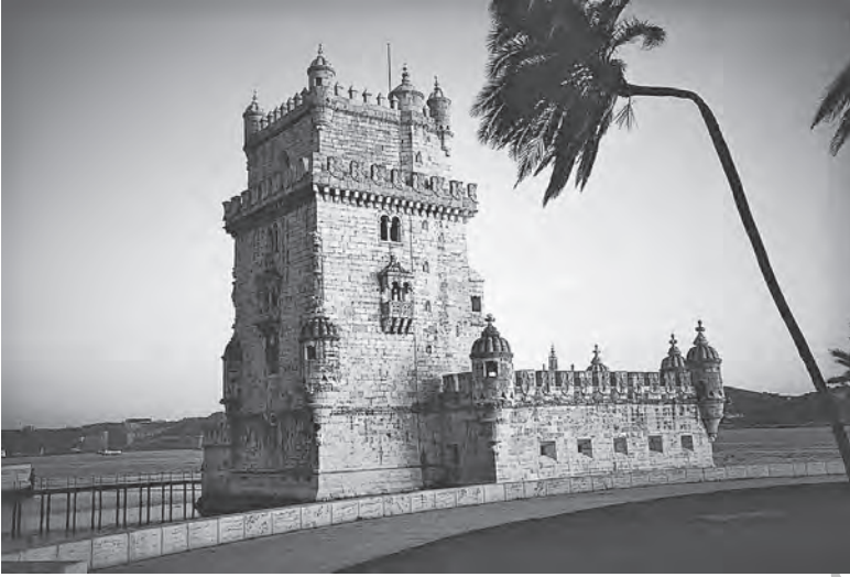
FIGURE 1.17. Tower of Belém.

Built in 1515–1521 as a fortress to protect the entrance to the Tagus River, the Tower of Belém is a symbol of Portugal's historic orientation to the western seas and its seminal role in the great maritime discoveries of the 16th century. The building is decorated in a late Gothic style peculiar to Portugal, known as Manueline.