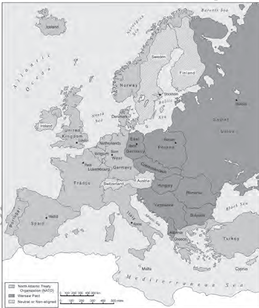
FIGURE 1.10. Cold War Europe.

The notion of an East–West divide in Europe has roots that run much deeper than the recent political and economic