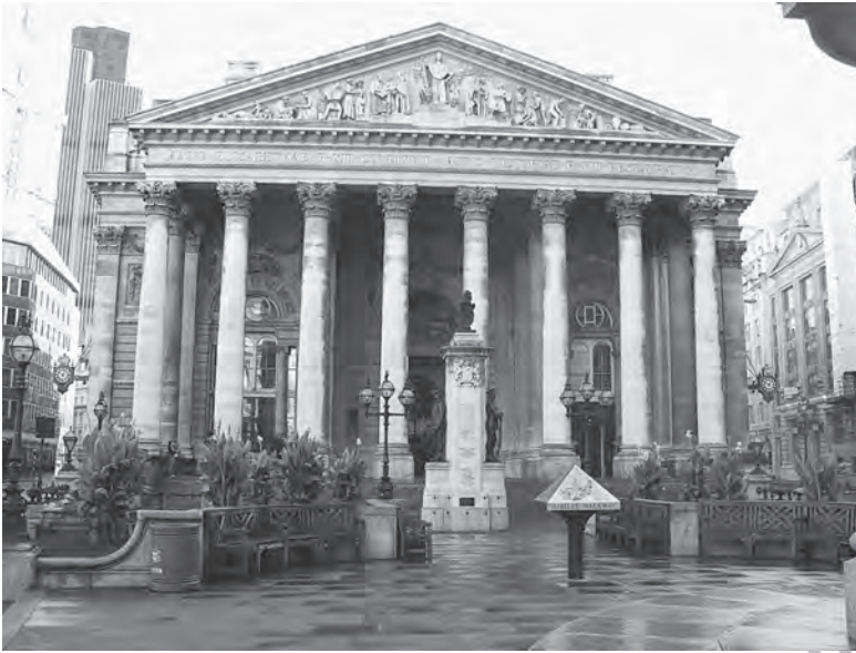
FIGURE 1.13. The London Royal Exchange. This building with its neoclassical façade was erected in 1842. It is the third building to occupy the site since Sir Thomas Gresham founded the Exchange in 1566 with the intent of supplanting the Bourse of Amsterdam as Europe's foremost marketplace. The Exchange is a symbol of London's long supremacy in the world of finance.

the language of science and commerce and has surpassed French as the prime medium for international communication.