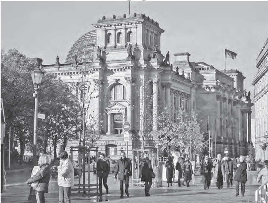
FIGURE 1.14. The new Reichstag. Originally opened in 1894, this controversial building survived World War II only as a hollowed-out shell of itself. Although restored after the war, the building lost its parliamentary function with the removal of the capital of West Germany to Bonn. Since the reunification of Germany in 1990, Berlin has once again become the capital city, and a newly refurbished Reichstag building, with a striking new glass dome, is the home of the German Parliament, or Bundestag .

The effect of German reunification since 1989 has been to draw the land and people of former East Germany, however painfully, out of their long isolation under socialist rule and into the western economy and life of the larger German nation. Despite the transfer of the German capital from Bonn, on the west bank of the Rhine, to the former capital of Berlin, a mere 50 kilometers from Germany's eastern frontier, and the lure of new markets and opportunities in east-central Europe, the postwar political and economic alignment