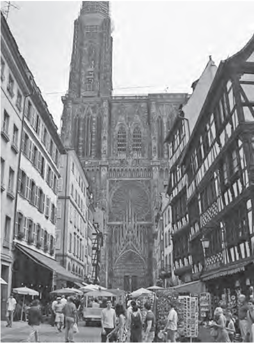
FIGURE 1.1. The Cathedral Quarter of Strasbourg. Tourists gather before the towering Gothic west front of Strasbourg's 12th-century Cathédrale Notre-Dame. The single tower, which rises to a height of 142 meters, was the tallest in Europe at the time of its completion. It is visible from much of the Alsace Plain.

ence Foundation, the European Center of Regional Development, and the Assembly of European Regions. The city likens itself to Geneva and New York as a world city and home to major international organizations, without being a national capital.