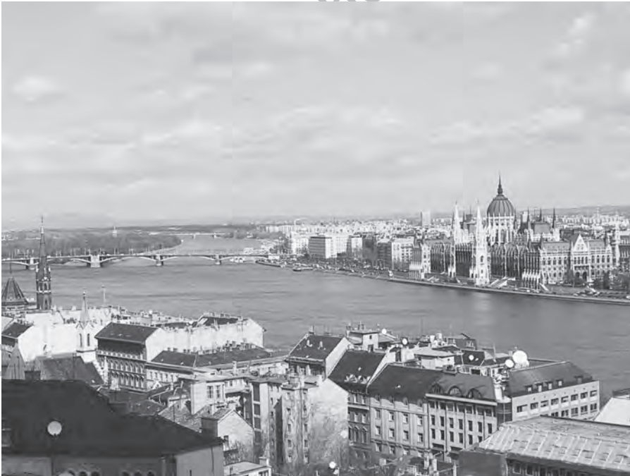
FIGURE 1.15. Budapest. The capital of Hungary and one of the largest cities of east-central Europe, Budapest straddles the Danube just as the river passes through the hills of western Hungary and opens onto the vast Hungarian Plain. It consists of two parts: Buda on one bank is the old medieval center; Pest on the other bank is the newer, more commercial, part of the city. This view looks upstream from the castle hill in Buda with the neo-Gothic-style Parliament building on the right in Pest. The city gained a reputation during the socialist years for its openness to Western influences, which in turn gave it a head start in making the transition to a Western-style market economy.

between Poland and the Soviet Union, the German population moved out and in the Soviet part was replaced with Russians. Under Soviet rule, Kaliningrad became an important industrial city and, as the Soviet Union's only ice-free Baltic port, the home of the Russian Baltic Sea Fleet, a function it still retains. Today, Kaliningrad stands out strikingly from the rest of east-central Europe. It has become an enclave of smuggling and other illicit activities, industrial decay, unimaginably difficult pollution problems, and abject economic ruin. Even by Russian standards Kaliningrad is poor, having one of the worst economies in the Russian Federation. It has become surrounded entirely by countries that have been successful in raising their political systems and economies to a level acceptable for membership in the EU. As a lone and troubled Russian outpost, it is likely to remain outside the mainstream of development and a source of concern for its