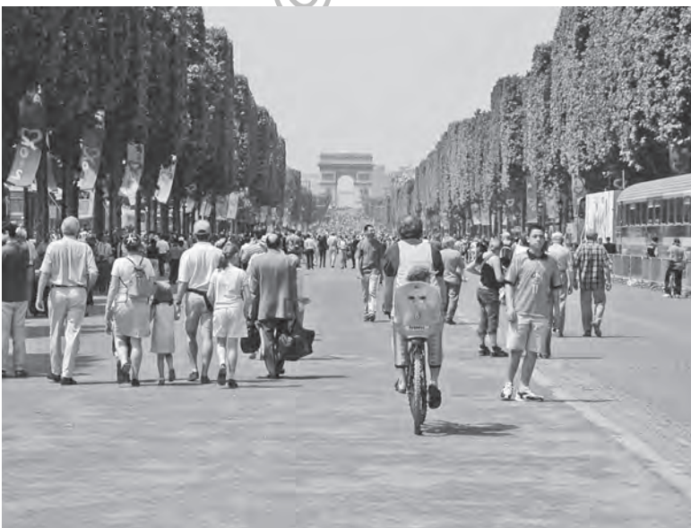
FIGURE 1.12. Champs-Élysées.

The other urban focus of western Europe is the cluster of cities north of the Rhine delta in the Netherlands known as Randstad (Ring City). The Randstad conurbation is