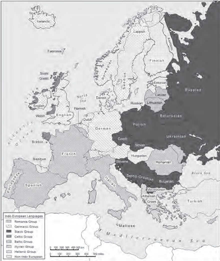
FIGURE 1.8. Indo-European languages in Europe.

once again. Today the tradition specifies that the youngest daughter in the family dress in a white robe and wear a crown of lighted candles (both symbols of light). Similarly, the revelries associated with the summer solstice, or the ancient, pagan “Midsummer,” often celebrated with communal bonfires and dances, were replaced in the Christian Church with a feast honoring St. John the Baptist on June 24. European cultures are replete with examples of this kind of survival of pre-Christian Indo-European myths and practices.