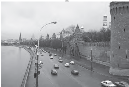
FIGURE 1.18. Moscow. The city of Moscow was founded here along the banks of the Moskva River in the 13th century. The early settlement, sheltered alongside the Kremlin citadel, grew to be the capital of Muscovy, and eventually a Russian Empire that covered large parts of two continents. The Kremlin walls, shown here along the river embankment, encircle the historic administrative and religious center of the city.

The Balkans constitutes the poorest region we have yet discussed. Over the past decade or so the region has been highly unstable politically, in large part due to the efforts of the new nationalist Serbian government (then the Republic of Yugoslavia, now known as Serbia) to create an ethnically pure Serbian state at the expense of neighboring Bosnians, Croats, and Kosovars. Linguistically the region is highly varied, and this, of course, is one reason for the political instability. It is, however, religion that is at the root of the ethnic strife. Although dominantly Eastern Orthodox in religion, the Balkans contains substantial Muslim minorities, the result of centuries of dominance by the Ottoman